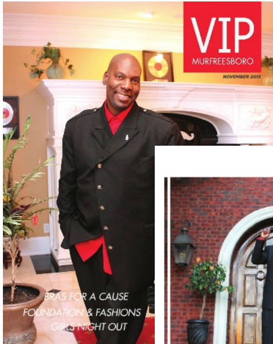
BRAS FOR A CAUSE FOUNDATION & FASHIONS GIRLS NIGHT OUT